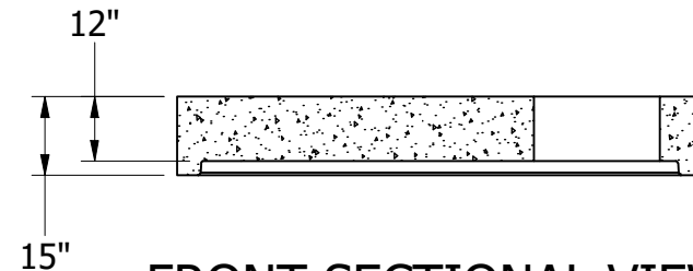
FRONT SECTIONAL VIEW